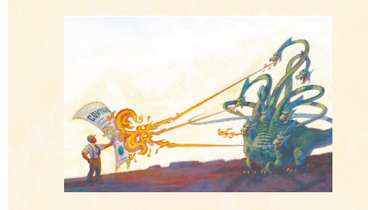
Rebuttal: Fortunately, benchmarking can be used to simplify variables and answer questions.