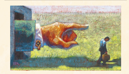
Rebuttal: Smaller steps are still worth publishing because they improve our understanding and raise new questions.

computing is so great that by the time results are confirmed they may no longer be of any relevance."<sup>8</sup> We can say the same about software. What good is an experiment when its duration exceeds the useful life of the experimental subject—a software product or tool?