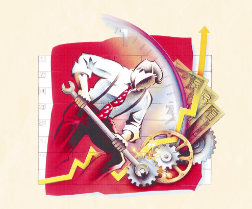
Rebuttal: If a question becomes irrelevant quickly, it is too narrowly defined and not worth spending a lot of effort on.

I'm confident that readers would continue to value good conceptual papers and papers formulating new hypotheses, so such papers would still be published. Experimental testing would come later.