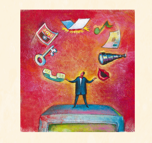
Rebuttal: Demos can provide incentives to study a question further. Too often, however, these demos merely illustrate a potential.

programming language research. They may save not only industry money, but also research effort.