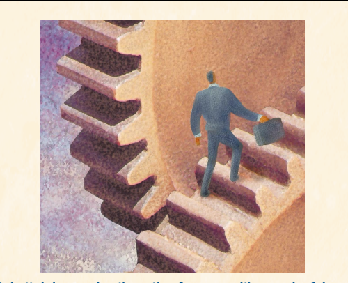
Rebuttal: Increasing the ratio of papers with meaningful validation has a good chance of actually accelerating progress.